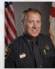
SHERIFF TOM KNIGHT Sarasota County